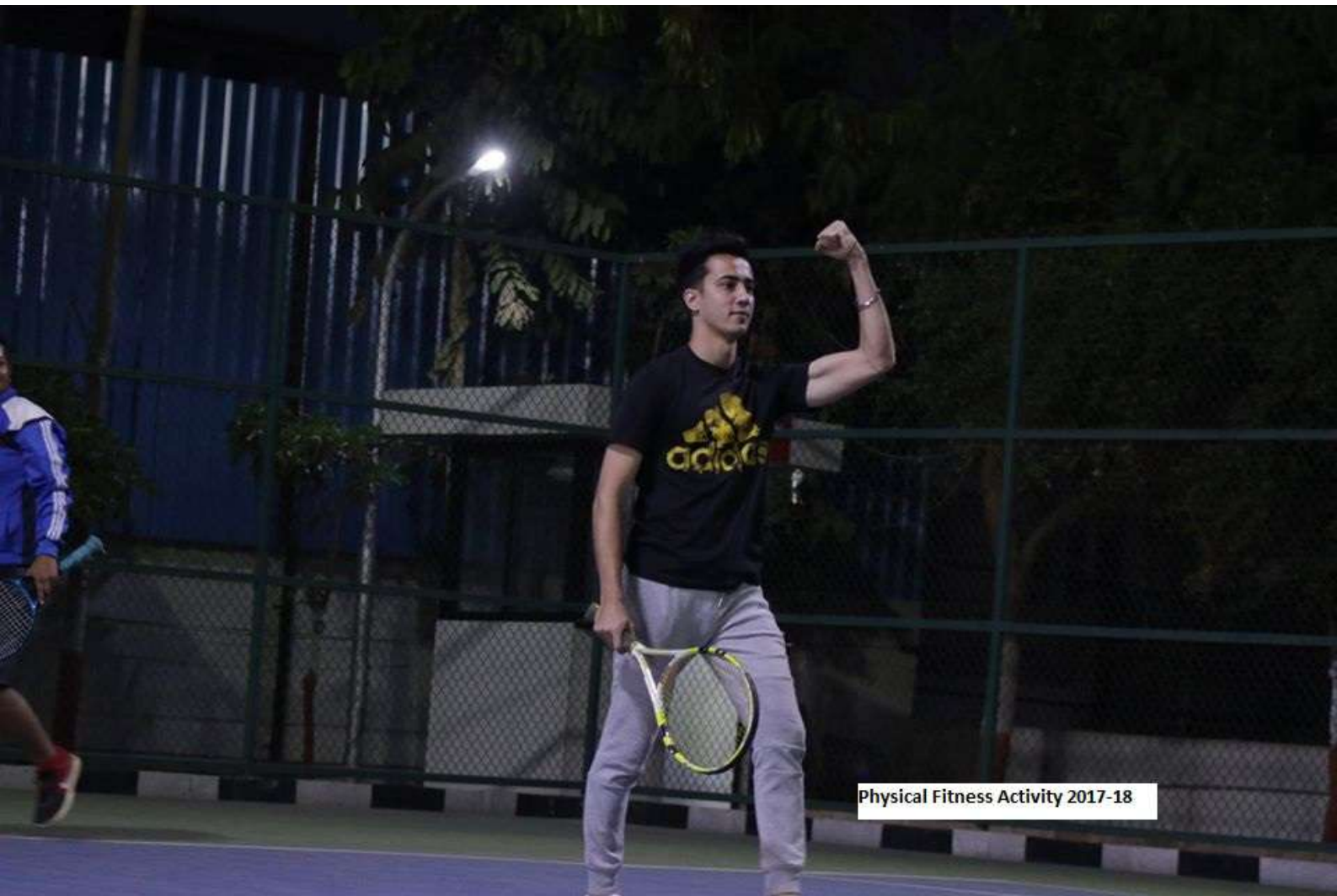
Physical Fitness Activity 2017-18